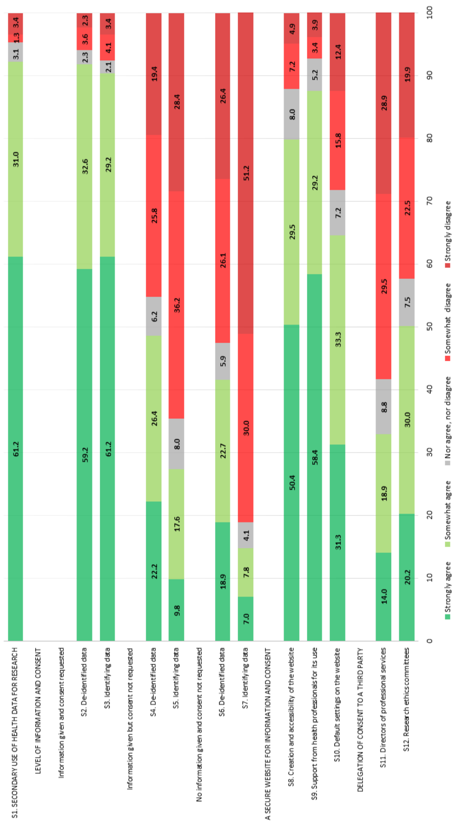
Figure 1. Level of agreement of citizen respondents toward each survey item.